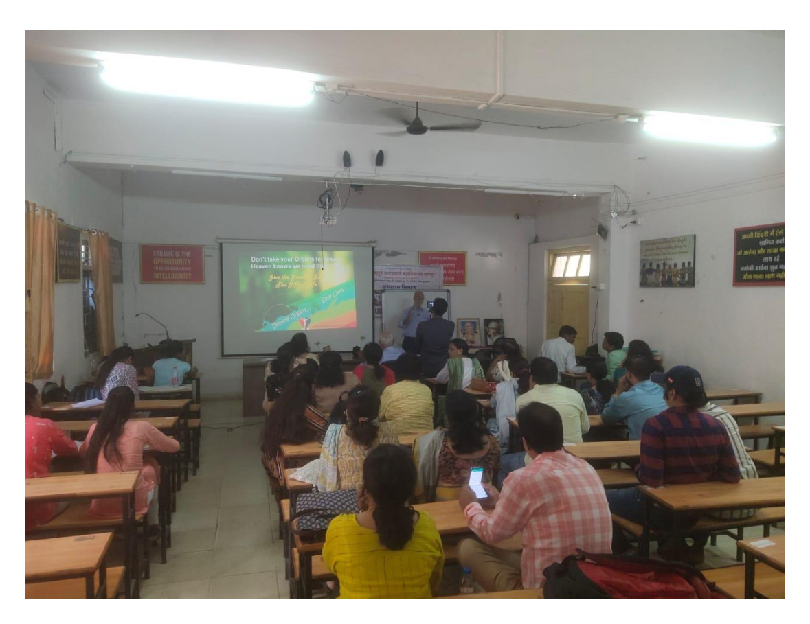
Participants attending the session