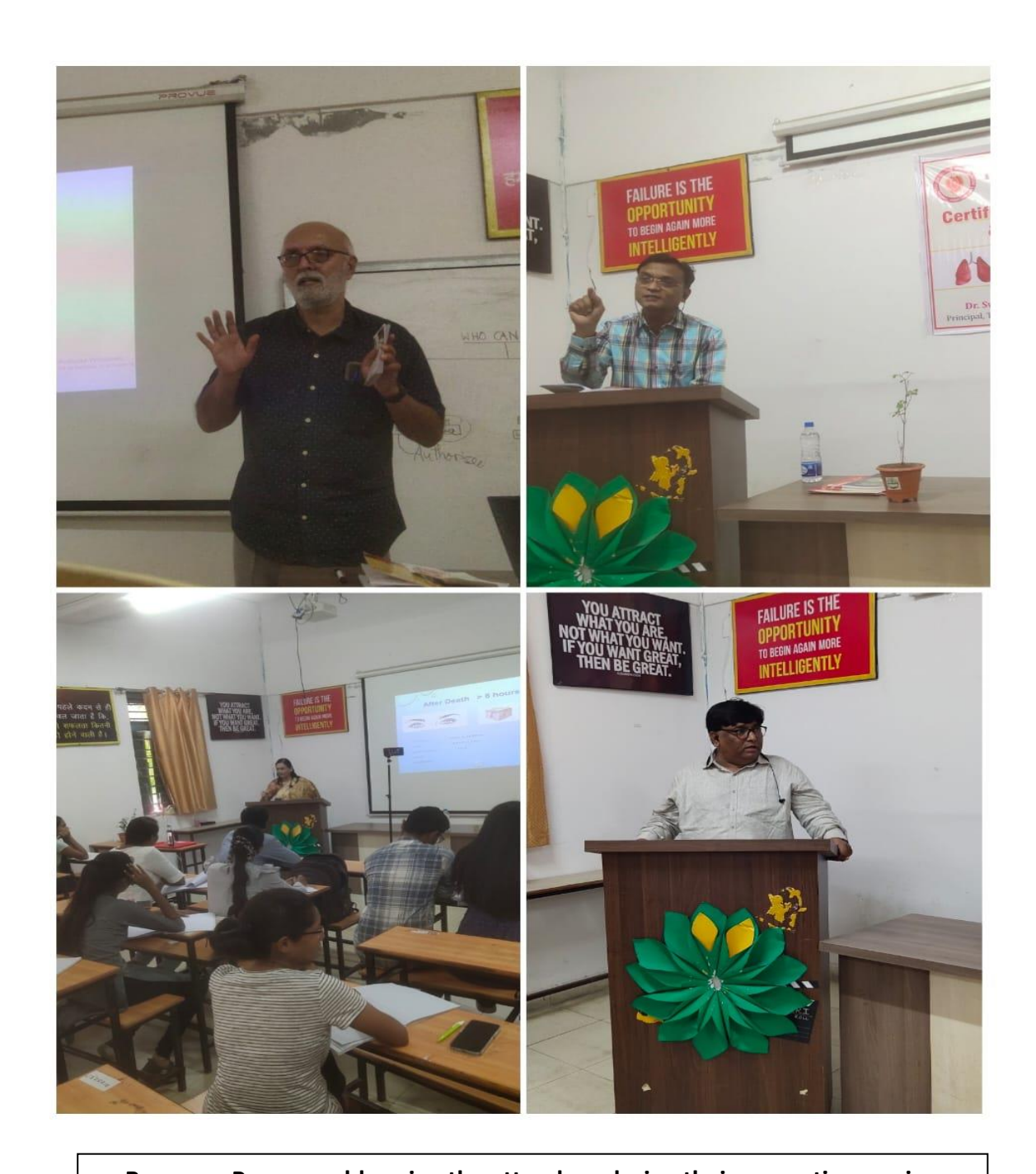
Resource Persons addressing the attendees during their respective session